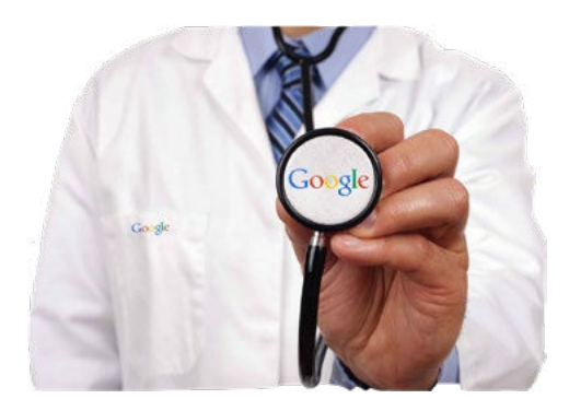
Debunked Dr. Google's diagnosis of a patient