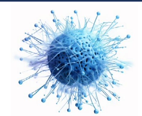
Completed a CME course on Oncology